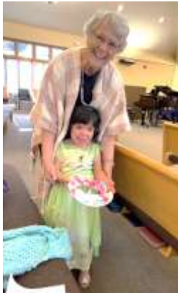
October 22 nd Sunday School Craft

Boxes and checks will be collected in the offering plates or church office no later than the second Sunday in November [that's the 12 th ]. Thank you everyone for contributing to this very worthwhile cause. UNICEF meets the mission focus of St. Paul in caring for children.