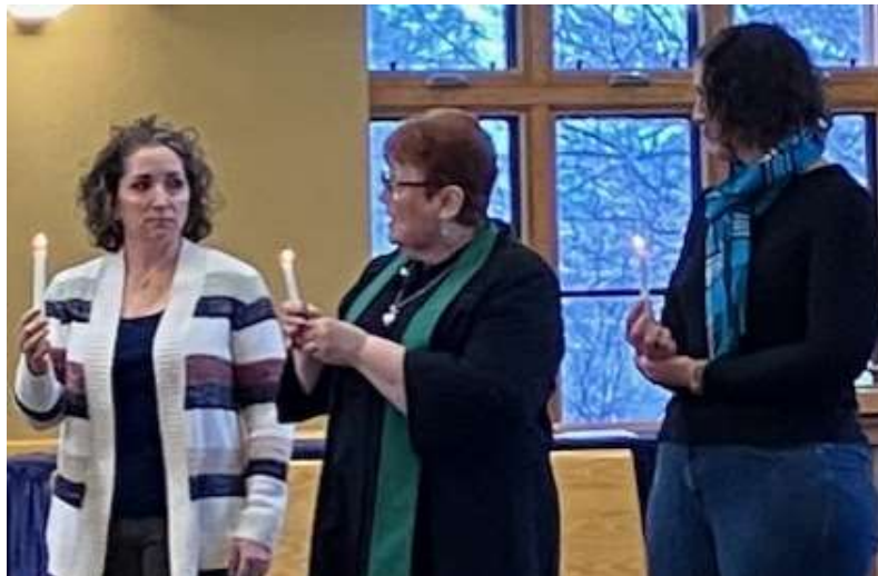
Sharing the Light

Continuously creating a vital congregation of faith, open to all, as we worship God, and boldly answer Christ's call to service.