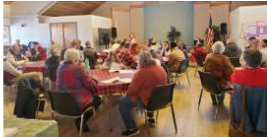
Annual Congregational Meeting