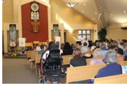
Easter Sunday other side