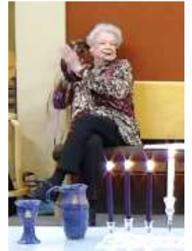
The tambourine came back