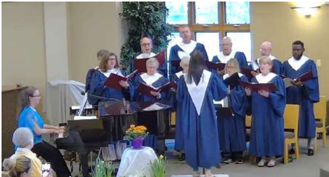
St Paul Choirs