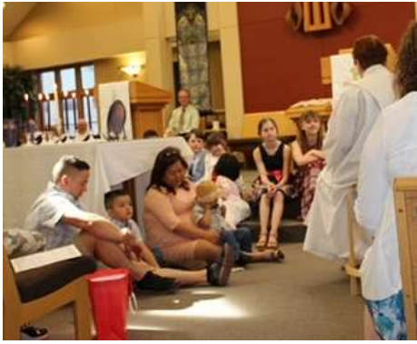
Children's sermon Easter Sunday